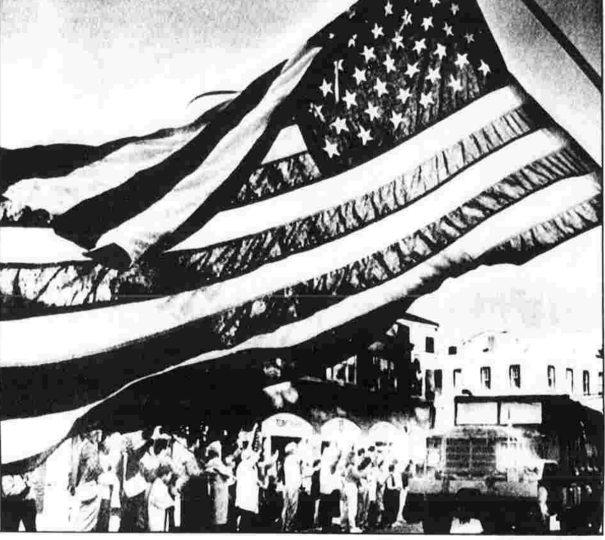
LEAVING FOR TRAINING — Under a waving U.S. flag, U.S. troops of the Army National Guard are cheered as they leave the Hingham, Mass., armory for further training in Ayer, Mass., before their possible deployment to the Persian Gulf Crisis.